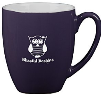
Duo-tone Bistro Ceramic Mug 16-oz-company logo on mug