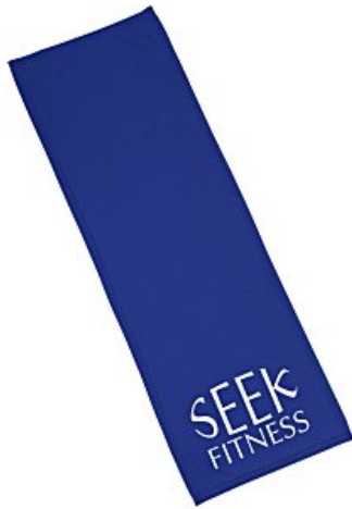
Imprinted Cooling Towel -company logo on the end of the towel