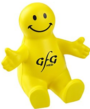
Smiley Guy Cell Phone Holder-company logo on body