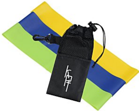
Strength Resistance Band Set –company logo on pouch